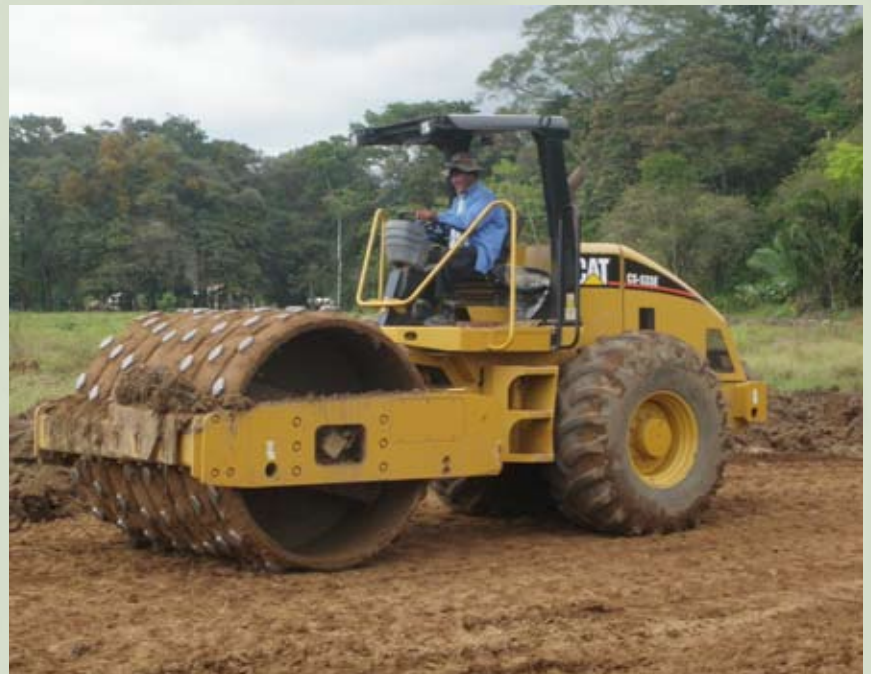
A vibratory soil compactor helps ensure a solid foundation for the miles of internal roadways being constructed.