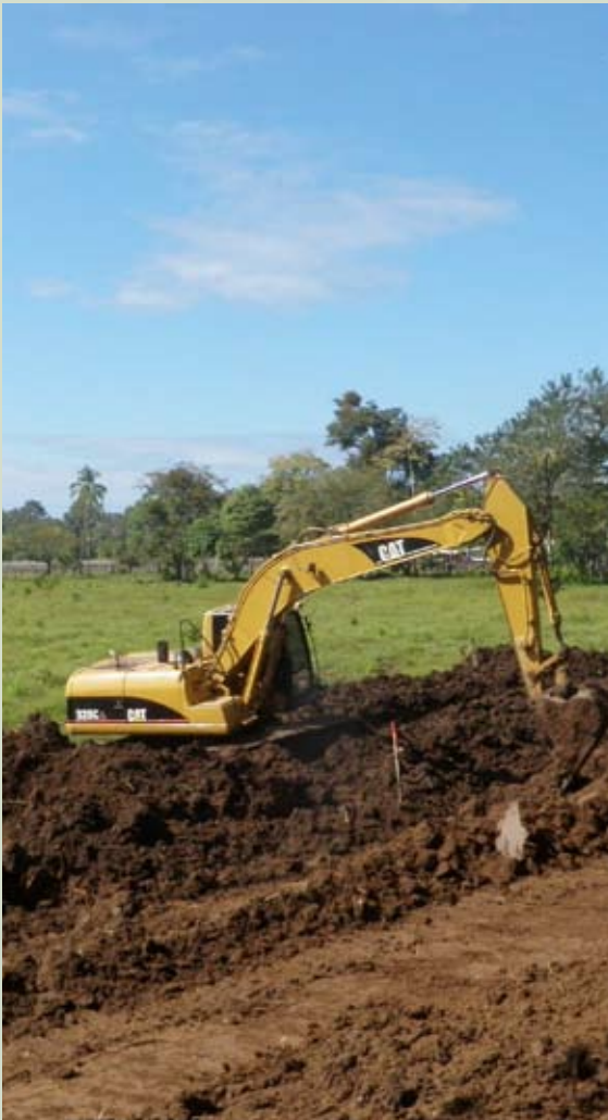
Excavator digging trenches for drainage culverts.